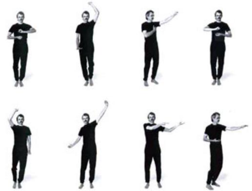
QI GONG FOR MUSICIANS